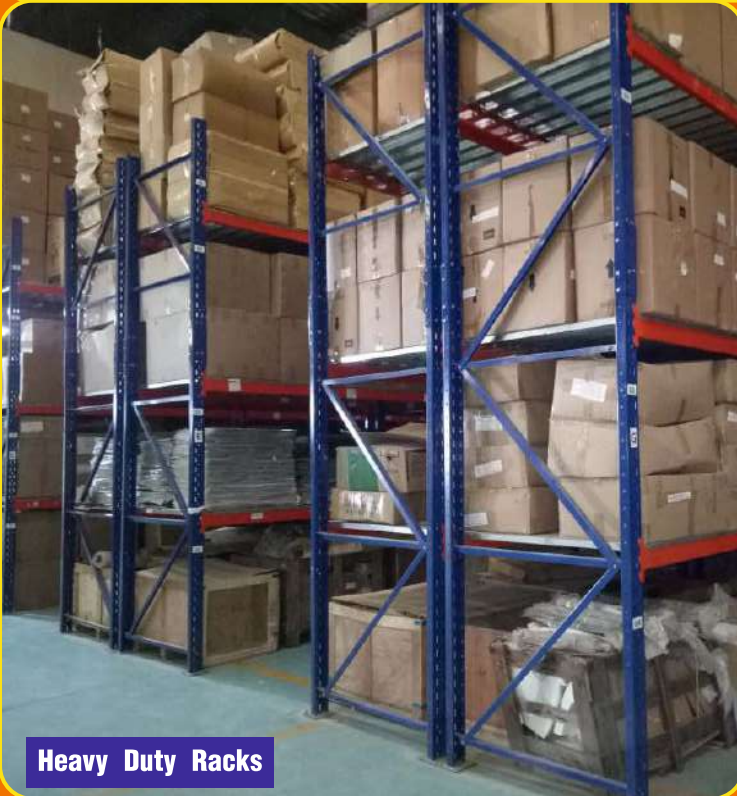
Heavy Duty Racks