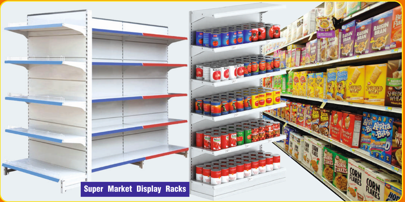
Super Market Display Racks