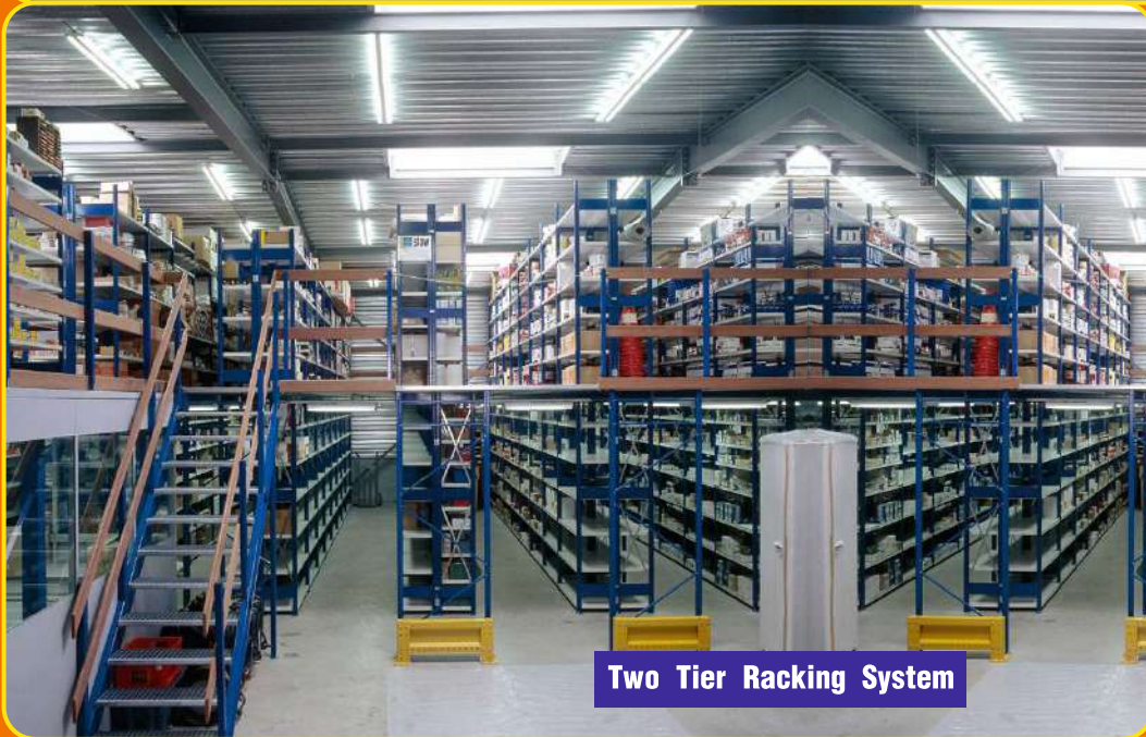
Two Tier Racking System