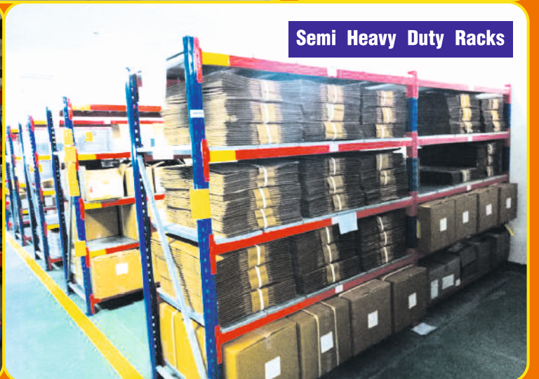
Semi Heavy Duty Racks