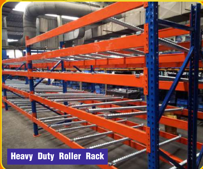
Heavy Duty Roller Rack