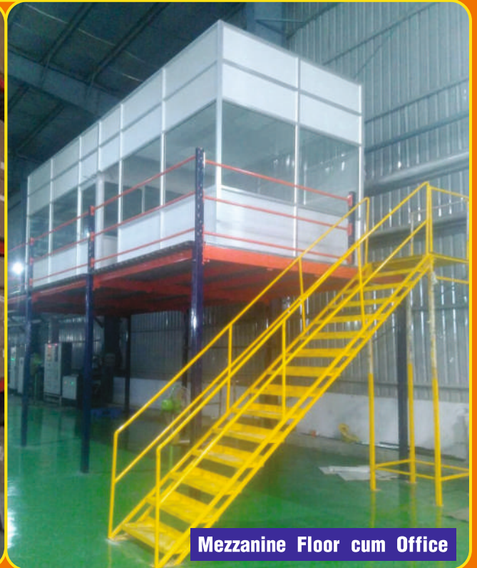
Mezzanine Floor cum Office

Since established in 1999, we, SELCO Steel Products, are one of the renowned manufacturing, supplying and installing an all - inclusive range of office furniture, which includes chairs, tables, storage, Slotted angles & display racks, mezzanine floors, mobile racking system, shelving systems and other allied products. Made using the quality raw material, these products are the preferred choice of our clients for their quality and utility. Backed by sophisticated infrastructure and highly experienced professionals, we are capable of meeting the exact requirement of our clients. Within the infrastructure, we have established a quality control department to ensure that our products are in compliance with international quality norms. Further, we constantly strive hard to upgrade our production facilities and this helps us to increase our production capacity.