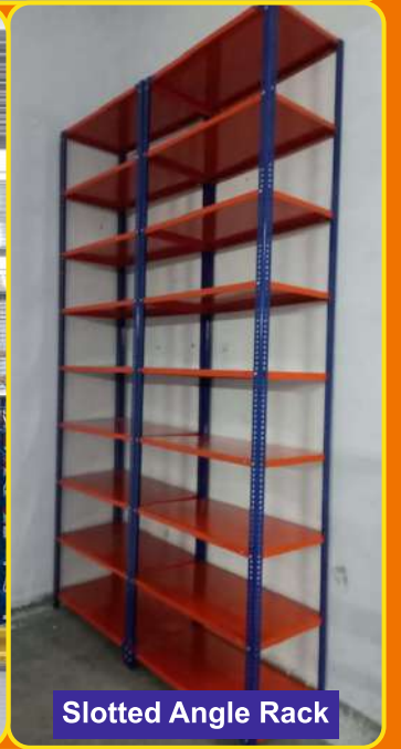
Slotted Angle Rack